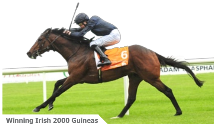
Winning Irish 2000 Guineas